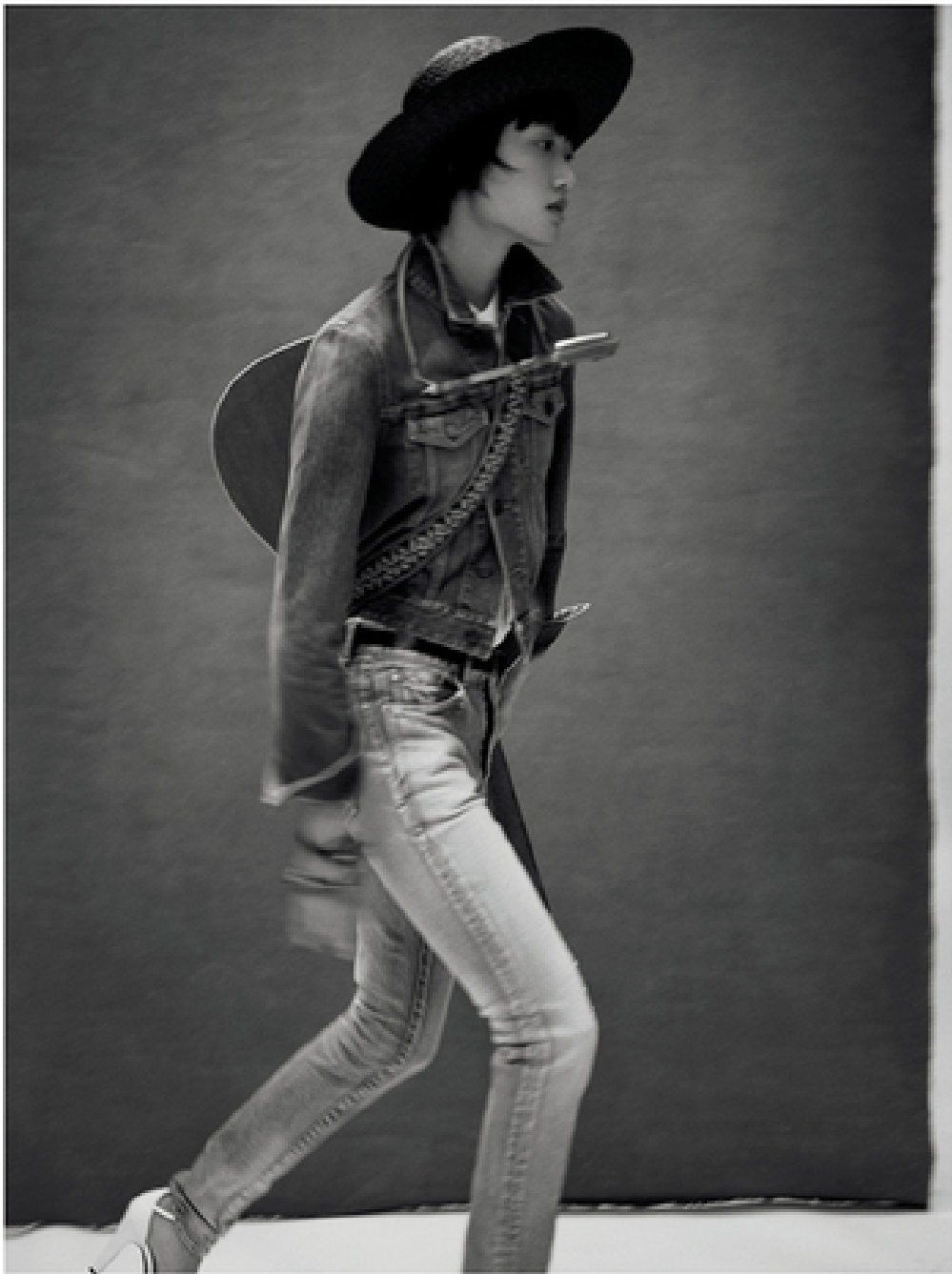
Blouson et jean en denim, et chapeau. SAINT LAURENT PAR ANTHONY VACCARELLO.