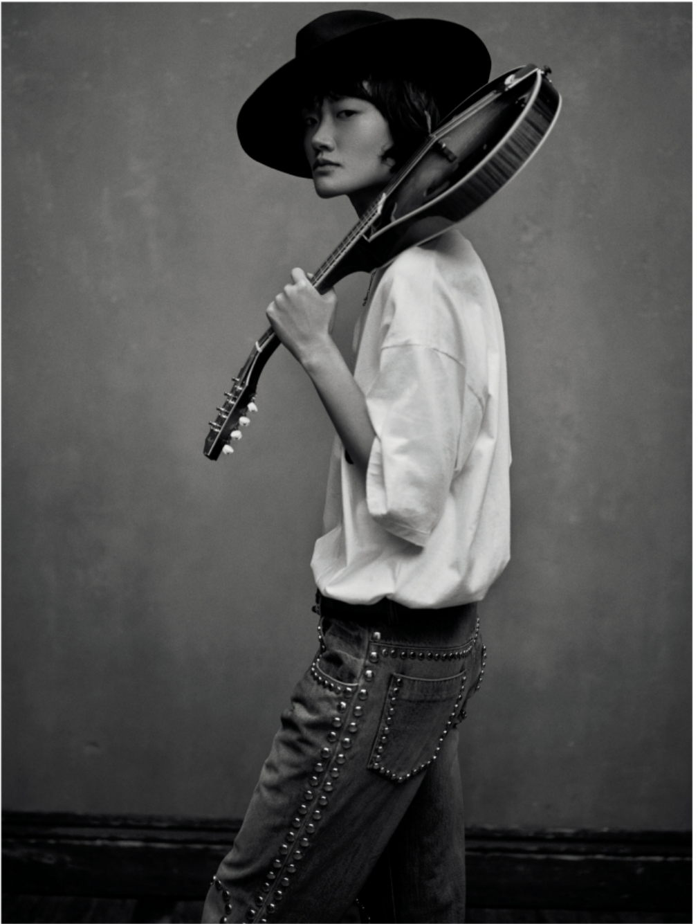
Tee-shirt en coton, jean en denim clouté et chapeau, GUCCI.