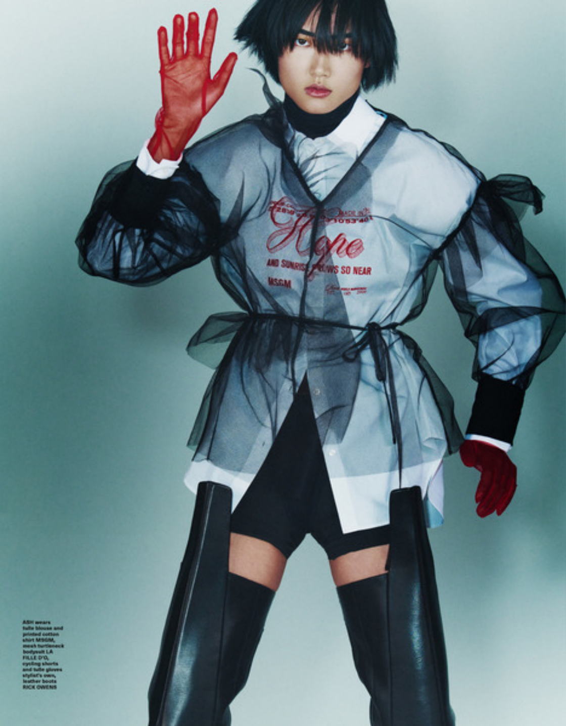
ASHI wears tulle blouse and printed cotton short MSGM, mesh turtleneck bodysuit LA FILE D'OL, eyeliner shorts and tulle gloves alyssa's own, leather boots RICK OWENS