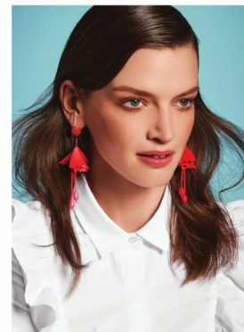
ADD A LITTLE The magic of colourful jewellery is that it packs a punch without over-asserting your look. Face-framing statement earrings are the accessory du jour. Use them to catch the eye or a set of beautiful necklaces to impress. Choose an accent that focuses on shape rather than sparkle to deliver a modern look that's an effortless match to updated basics. Like a cultured elite. WOMEN'S WEAR LONDON/NEW YORK/LOS ANGELES